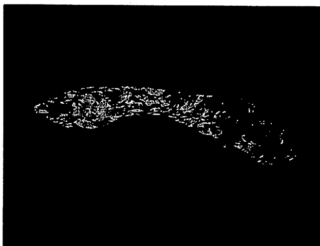
Figure 1. Cascade Hotdog® Orthosis.